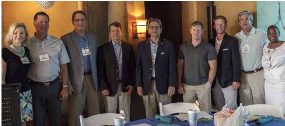
2017-2018 Hinman Dental Society Officers and Executive Council who were present at the annual meeting.