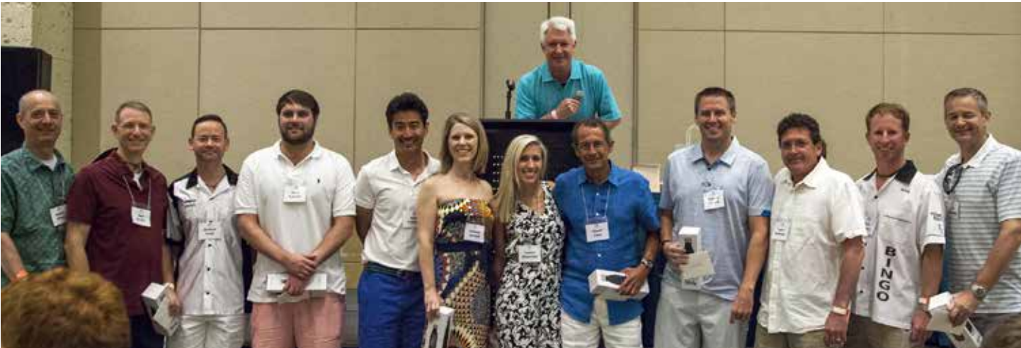
Hinman Annual Meeting Chairmen