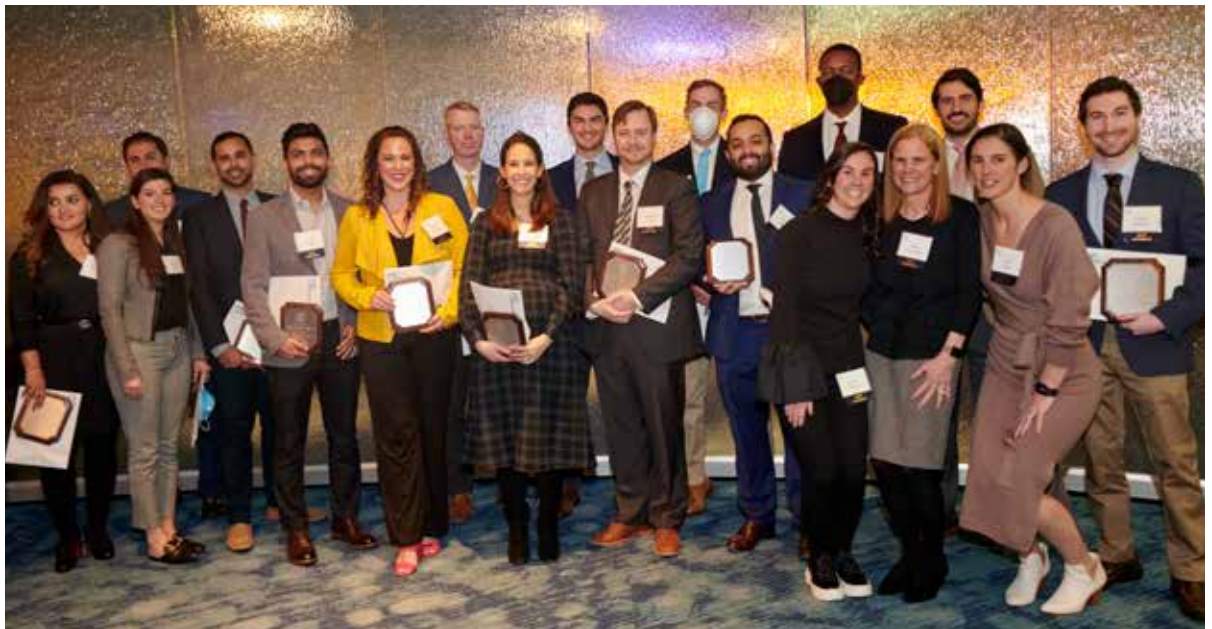
The Hinman membership approved the applications for 23 new Hinman Members.