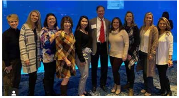
Hinman members and their staff enjoyed the January Membership Meeting.