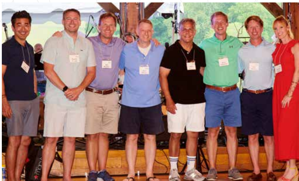
2021 Annual Meeting Chairs