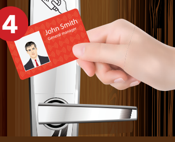
Do not needlessly display guestroom keys in public.

When walking, stick to well-lit, busy areas; walk with a purpose. Don't be distracted by use of your head phones or cell phone.