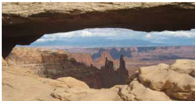
Mesa Arch, located in Canyonlands National Park, near Moab, Utah

I promise the experience will do you wonders, and that you will return to your practice and your life with new energy, an appreciation for all that you are and all that you have, as well as a renewed spirit and sense of goodwill!