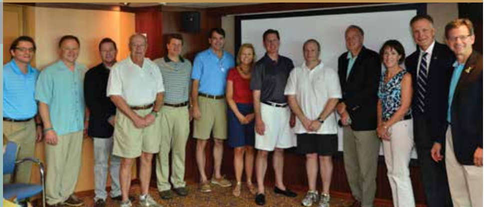
2012-2013 Hinman Dental Society Officers and Executive Council