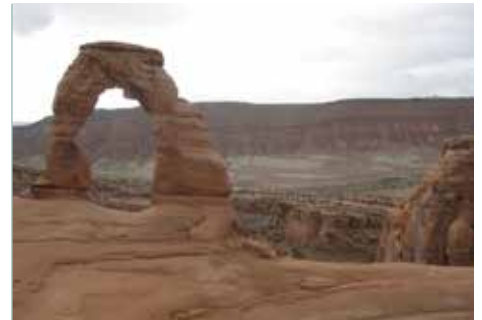
Delicate Arch, located in Arches National Park, near Moab, Utah

Whether you're hiking to Delicate Arch, the Devil's Garden, or through the ranger-led “Fiery Furnace” of Arches, you're hiking some of the finest trails in the nation. And Canyonlands offers a diversity of hikes as well, including the well-known Mesa Arch trail which leads to the arch and the classic view through it of the “washer woman” rock formation.