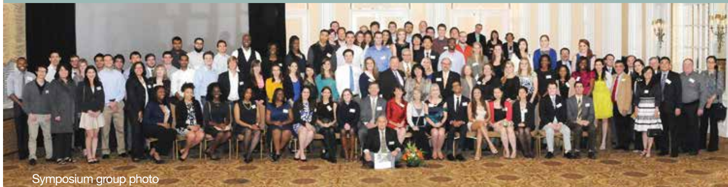
Symposium group photo