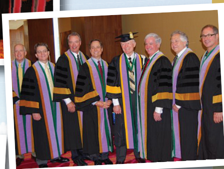
Hinman Members Inducted into the International College of Dentists