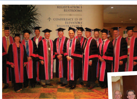
Hinman Members Inducted into the American College of Dentists

Proposed New Hinman Members November 2008 8